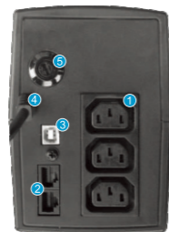
850 VA (Plastic Case)