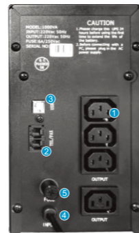
2000 VA ~ 2500 VA (Metal Case)